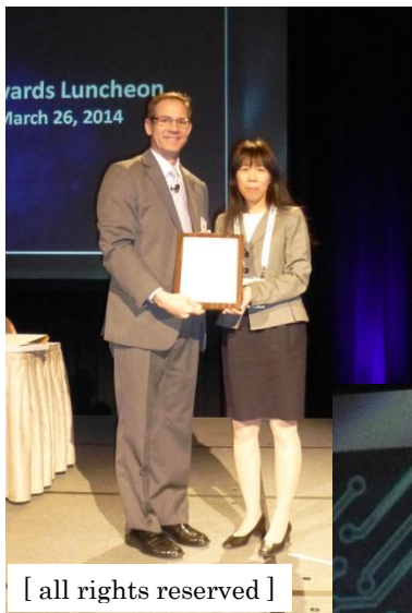
◆Commemorative photo with IPC President

IPC - Association Connecting Electronics Industries is a trade association representing the electronics industry, particularly printed circuit board designers and manufacturers.