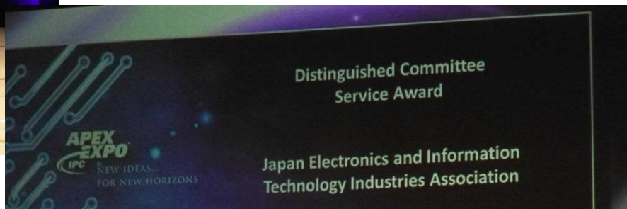
◆The awards ceremony (1)